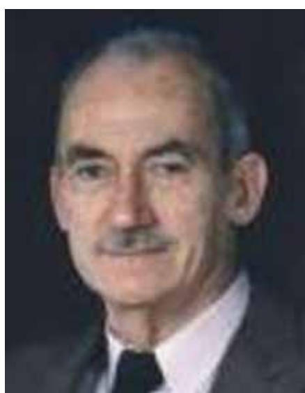
Figure 4. Paul Tessier.

were more committed to treating traumatic facial injuries and could give little time to new developments in the correction of congenital facial deformity.