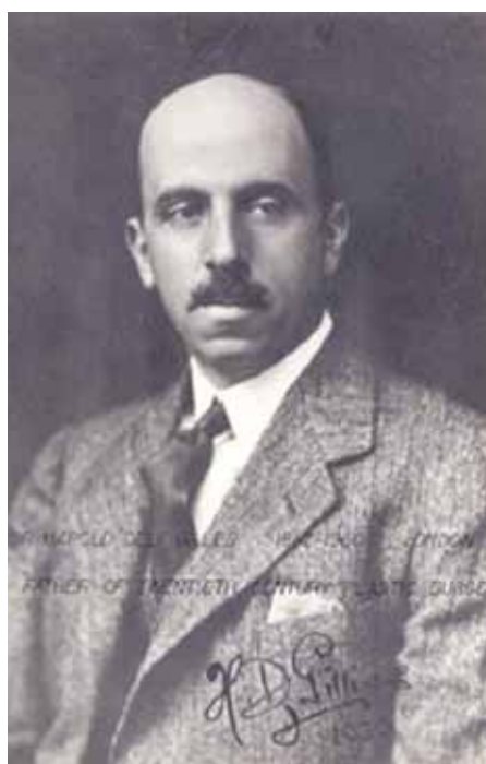
Figure 3. Sir Harold Gillies.